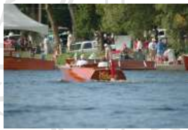
Annual 'Ottawa International Antique & Classic Boat Show' presented by MCBC held at Long Island Lock in Manotick.