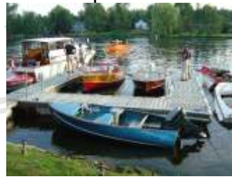
Wednesday Cruise Nights during the Summer