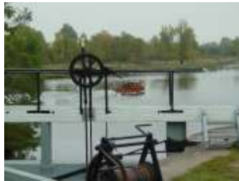
Fall Burritt's Rapids Run and Picnic