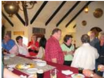
Social Events Throughout the Year