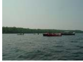
Weekend Boating Trips/Tours