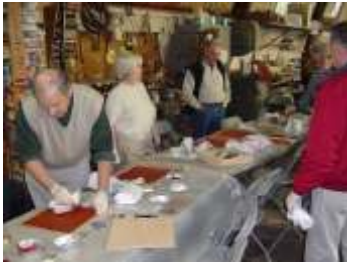
Spring and Fall Workshops