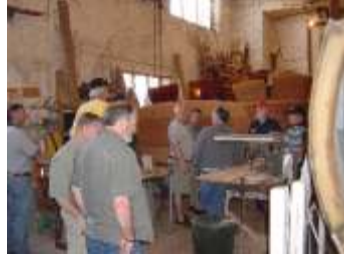
Boat Shop Tour