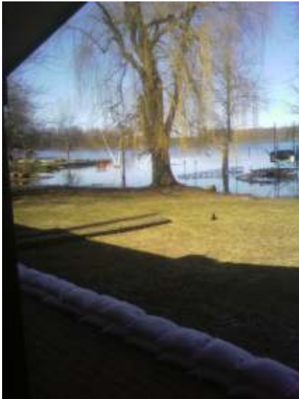
April 15th - Melt finished! Almost high water.