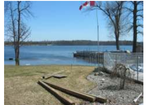
April 17th - Reached a peak! The flag still flies.

"It was an awesome display of nature that brought close families even closer together playing in their sandboxes and building sand castles around their houses. Then we all watched as our wonderful river crept up tentatively to greet us, enticing us to its shores as it gently receded, leaving little treasures of flotsam in its wake." John (Richardson)