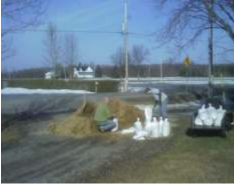
April 9 - Men at work stacking sacks!