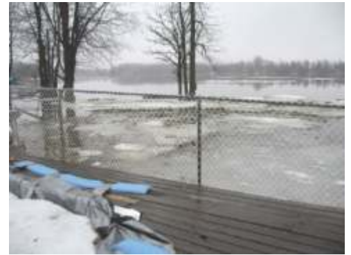
April 13th - The Rideau meets the pool!