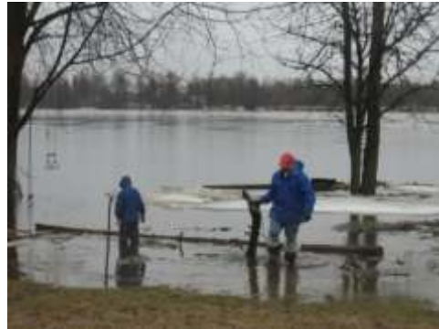
April 17th - High Water.