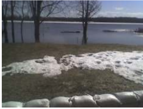
April 10 - More to melt! Bags at the ready!