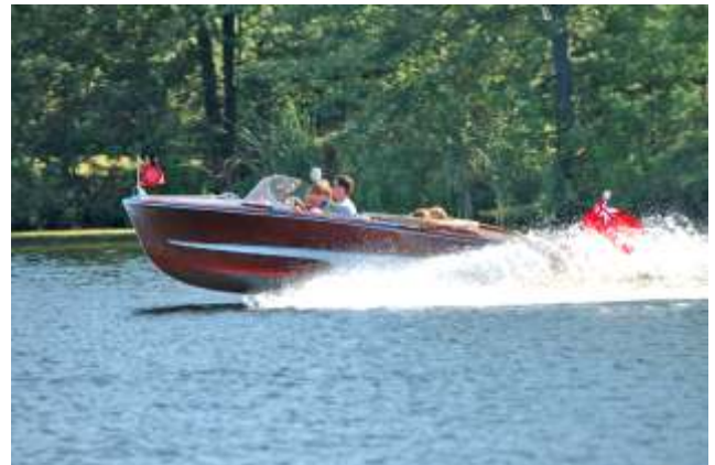
"Ilikai" at speed at last summer's boat show