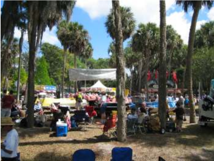
A nice backdrop for a boat show.