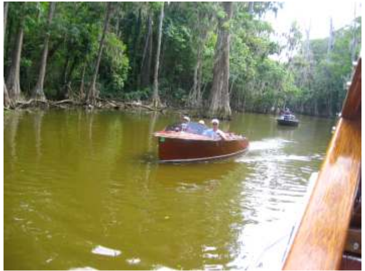
A view along one of the cypress-lined canals inter-linking Florida's inland chain of lakes.

Friday's daytime activity consisted of a one and a half hour cruise by boat to a scheduled lunch picnic, which I might add was most well attended. This was followed in the evening by a Captain's Cocktail Party.