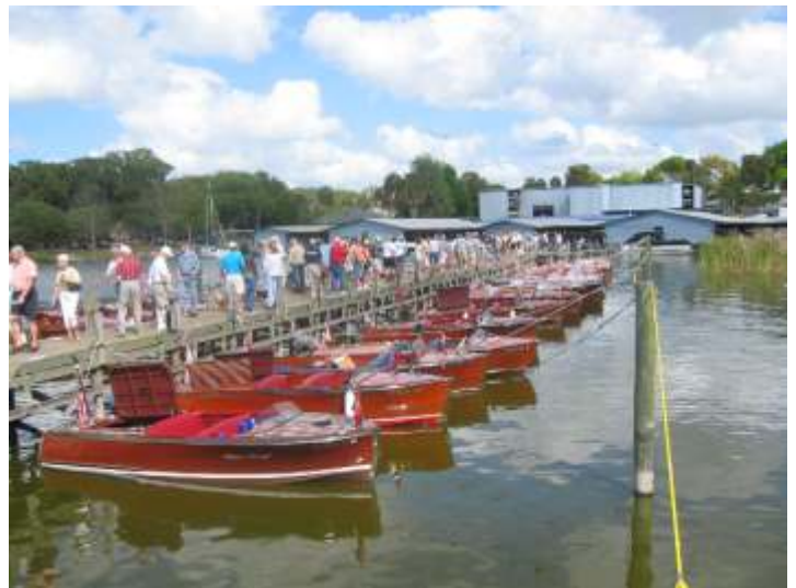
In-water exhibits were plentiful at the Mount Dora Antique Boat Festival.