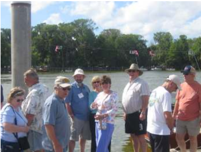
The Jelleys and Tilleys enjoying a sunny day at Mount Dora.