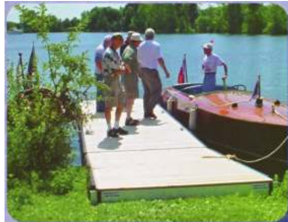
These pictures taken at last year's Ottawa International Antique & Classic Boat Show appear in this year's updated Dockmaster brochures. Dockmaster was a dock sponsor at last year's show.