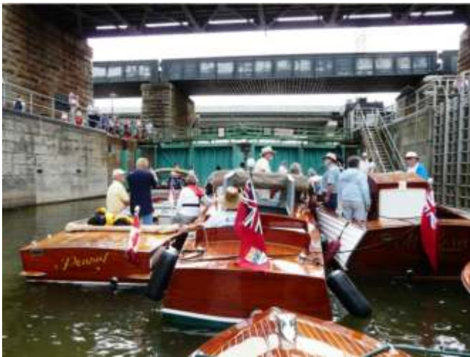
St Anne de Bellevue lock