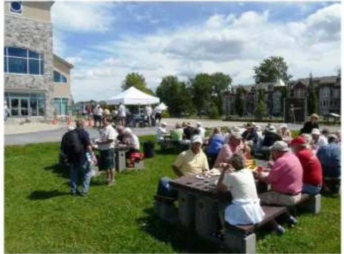
Lunch on Lachine Canal

On Thursday, Festival organizers led a pre-show run down the St. Lawrence to Ile Ronde, including a visit to a winery for lunch and wine tasting. Some MCBC members rode on larger Montreal boats in case the water proved to be rough (it was not).