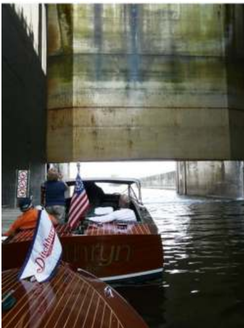
Carillon lock guillotine gate