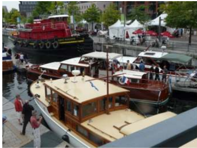
Cruisers and commuters were common among Montreal boats (commuter in the foreground was best of show)