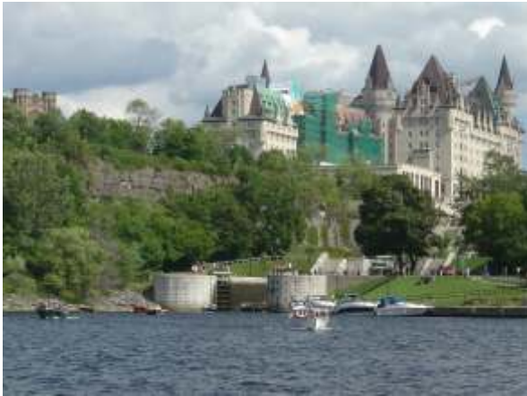
Exiting the Rideau Canal Locks below the Chateau Laurier in Ottawa