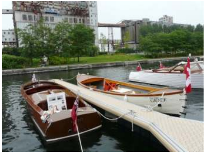
"Saving Grace", a 1920's ship's life boat, moored next to the boat that sank!