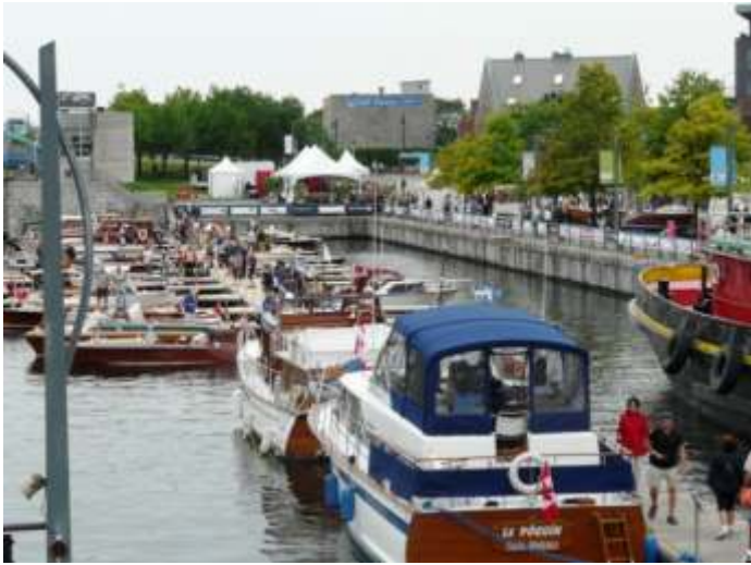
Boat festival site