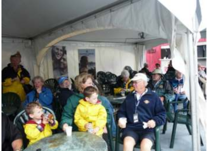
Awards ceremony in participant's VIP tent